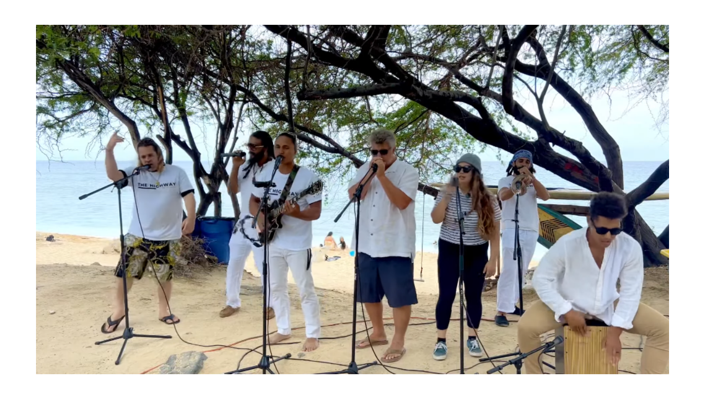
Press Kit: The Highway - Elevate Your Venue with Our Unforgettable Musical Experience